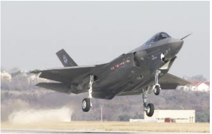
The F-35 Lightning II takes off on its first flight. USAF officials want to buy F-35s in lots of 100 a year, but probably won't get that many.

requirement for 381. All agree the smaller figure was driven by monetary constraints and not by strategy.