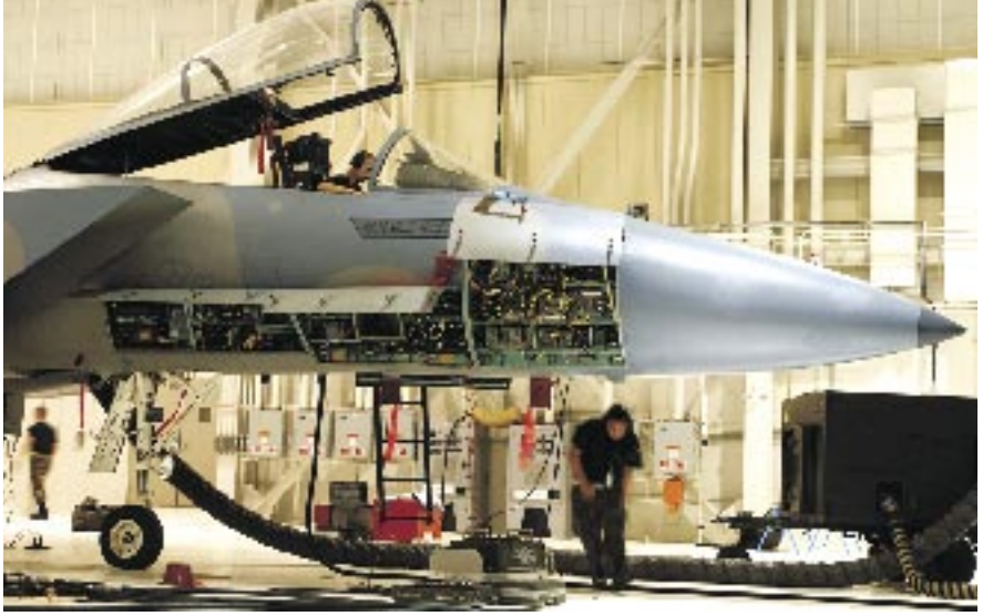
Airmen perform maintenance on an F-15 during Phase 1 of an operational readinness Inspection at Langley AFB, Va.

aircraft—new ribbing under weapons stations, and replacement of some of the flight-control system.