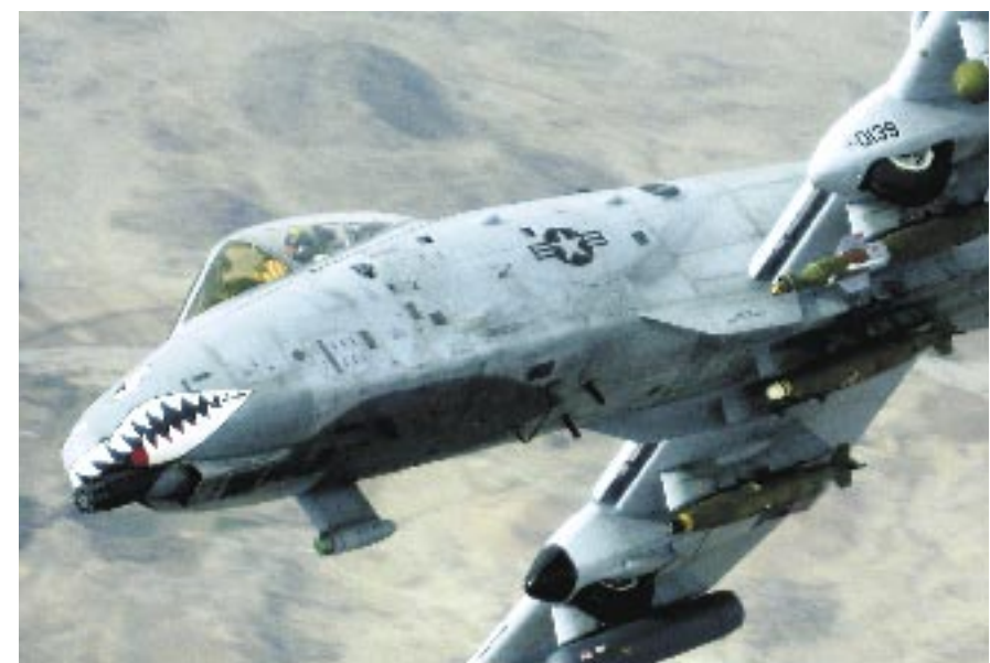
An A-10 Thunderbolt II pulls away after refueling over Afghanistan last December. After numerous brushes with retirement, the A-10 will get a major upgrade.